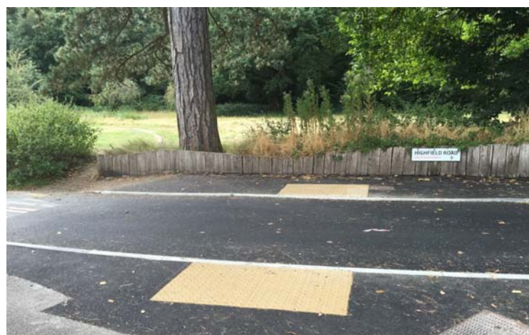
Existing pedestrian crossing which would align with the original path

The HRA preferred solution is to align the existing road crossing (below) with the original straight path (above) for easy access to the common for all users.