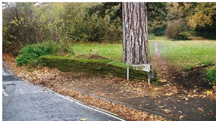
HRA would like to see the restoration of the original path shown above

http://southamptoncommon.org/contact/maillinglist