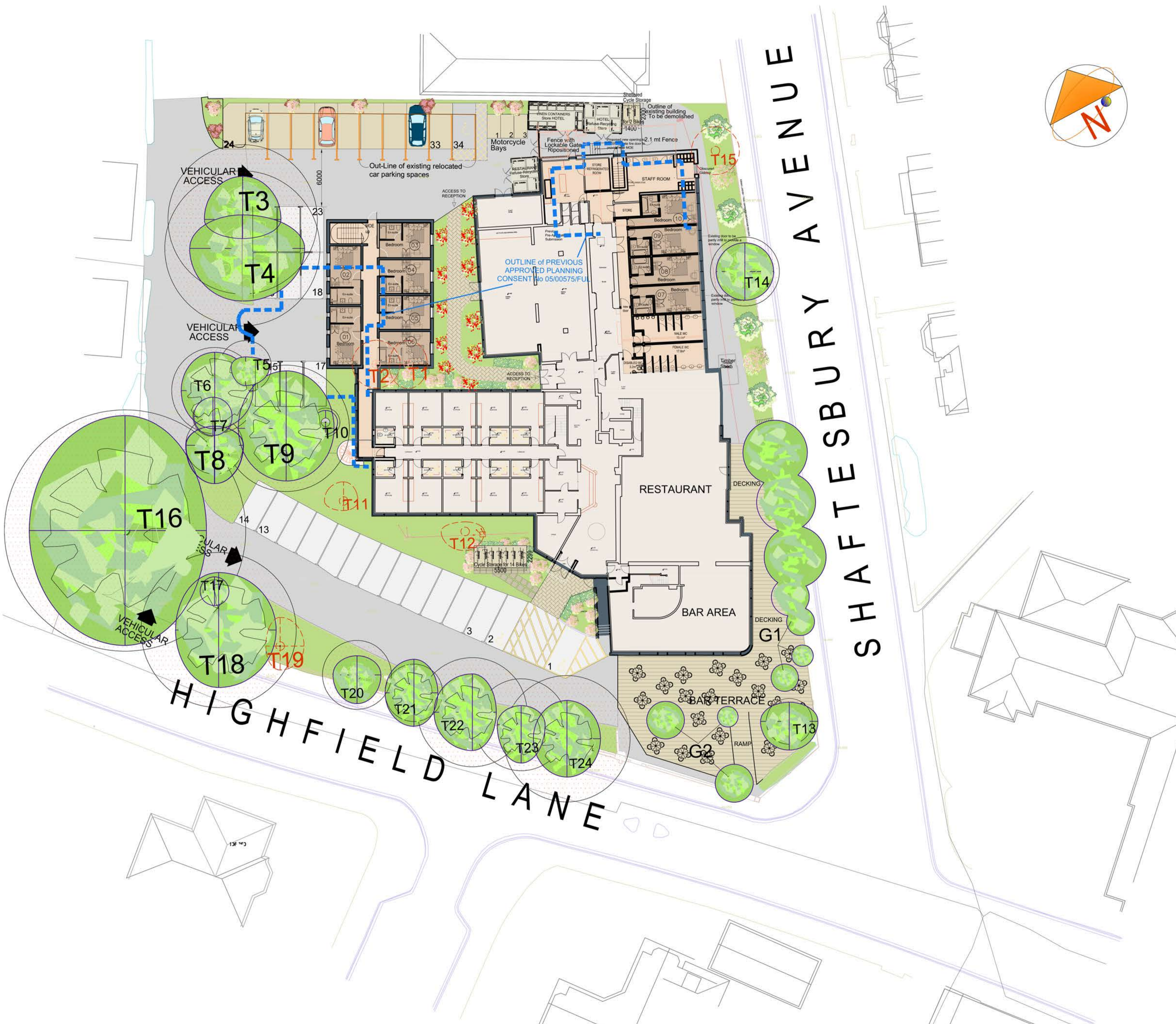
Site Plan scale 1:200