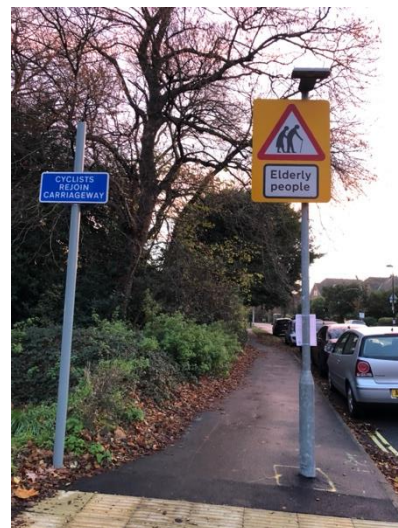
Westwood Road sign