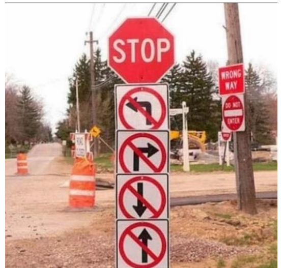
Government policy 2023???