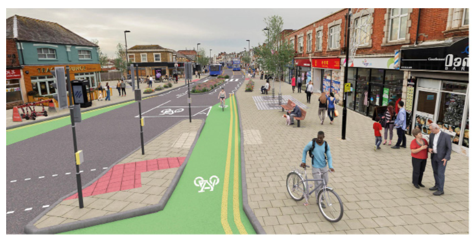
Illustration of proposed Portswood Broadway Bus gate