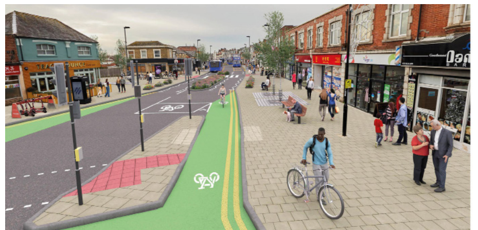
Illustration of proposed Portswood Broadway Bus gate